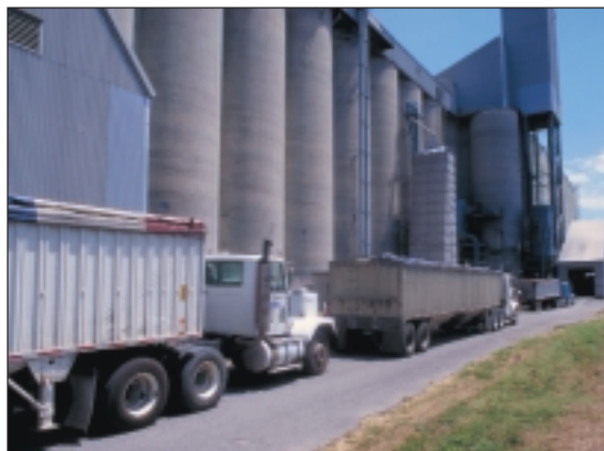
Segregation - Theory vs. Practice. Segregating biotech crops from their conventional counterparts has proven difficult in practice. Some data suggest the costs of segregation are not matched by price premiums.

How much commingling of StarLink with other corn may have occurred in the marketplace? USDA's Economic Research Service (ERS) estimates the potential (upper-bound) volume of marketed StarLink-commingled corn from the 2000 crop located near wet and dry millers prior to October 1, 2000, at 124 million bushels (Lin, Price, and