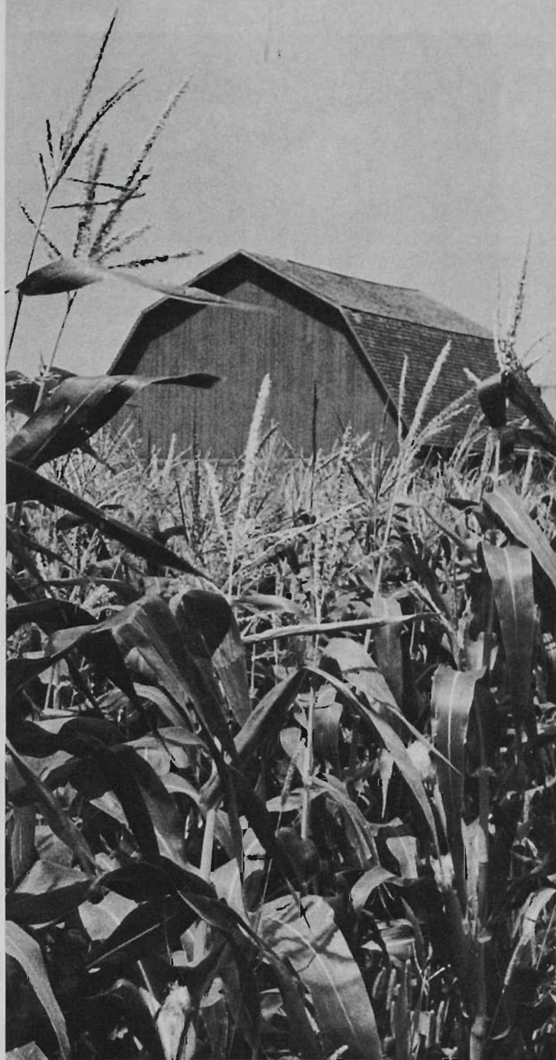
Differentiating traditional commodities and certifying qualities that cannot be seen are two agribusiness challenges for the future.

For all agribusiness firms, be they input suppliers, producers, or processors, the first step toward a brighter future is adopting a strategic frame of mind: You must envision the silk purse. The