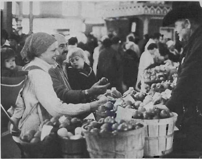
The whole food system from seed to table must focus on the ultimate consumers and their demands for quality.