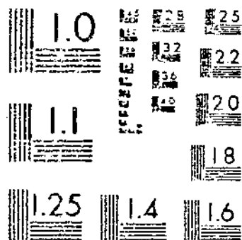
MICROCOPY RESOLUTION TEST CHART NATIONAL BUREAU OF STANDARDS 1963-A