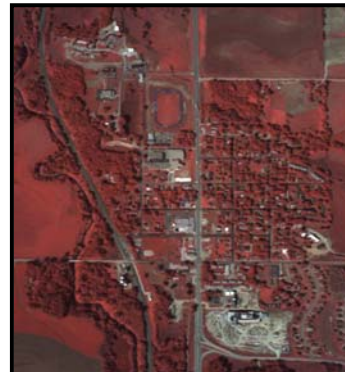
Figure 4 Winnebago Reservation Color-infrared imagery

The NASA Nebraska Space Grant & EPSCoR Program has placed an emphasis on working with Native American communities in the state. In 2002, a Geospatial Extension and Research Specialist (GES) was hired to help disseminate geospatial technologies to tribal communities. The GES acts as a liaison between tribal communities and the Nebraska Airborne Remote Sensing Facility. The Winnebago and Santee Sioux are extremely interested in using remote sensing and other geospatial technologies to manage tribal resources including transportation routes and infrastructure.