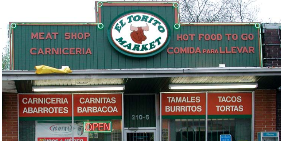
John Cromartie, USDA/ERS

At the same time, population dispersion was much more prevalent among nonmetro Hispanics. Their population grew by 42 percent in the 433 completely rural, nonadjacent counties, just a few percentage points below the 46-percent rate for Hispanics in highly urbanized counties.